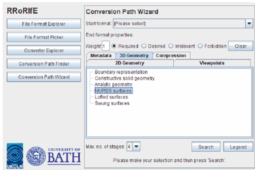
Figure 3: User Interface to RRoRiFE

tests have found it at least as likely for the property to be corrupted or lost as it is to survive. Lastly, ‘fair’ is used in all other cases, alongside an explanatory note.