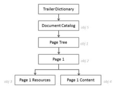
Figure 3: Graph and according PDF object Ids for Hello_World.pdf file

process described in section 3.2. To allow files within the test corpus data set to be referenced, we introduce a naming scheme for the test files and cases. The scheme is based on a scalable ontology, which follows the basic PDF structure as shown in Figure 1. The main four sections are numbered with the body section (T02) branching off in separate subsections for possible object types. For this paper, the object types document catalog (T02-01), page tree node (T02-02), page node (T02-03), page resource (T02-04) and stream object (T02-05) are analyzed further. While different types of objects are possible for page resources and stream objects, we only focus on font (T02-04-01) and text respectively. Each test case is numbered according to the section in which the deviation is introduced in (Txx-xx-xx), followed by a 3 digit number (_xxx). In addition to the test case ID, the file names contain a brief description of the feature tested, e.g. "T001_header_invalid-major-version.pdf". All of the test files are listed in a google spreadsheet<sup>18</sup>. The created test corpus has been made available on GitHub<sup>19</sup>.