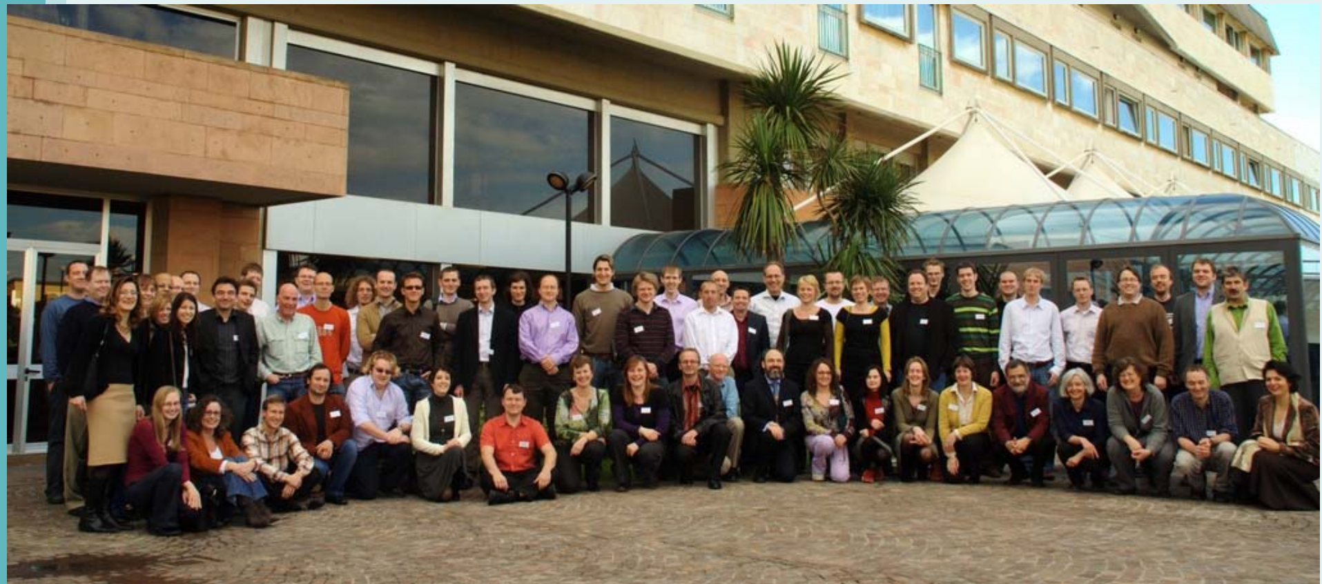
All Staff Meeting, Feb 2007